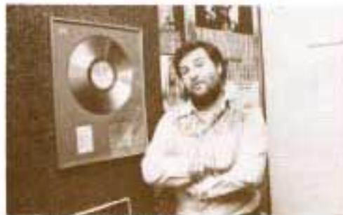
Crooked Promotions Ltd.

drinking prowess C- state of liver B+ hangover rating C