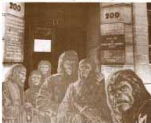
Our trusty roadcrew before and after a tour.

drinking prowess B state of liver C+ hangover rating C+