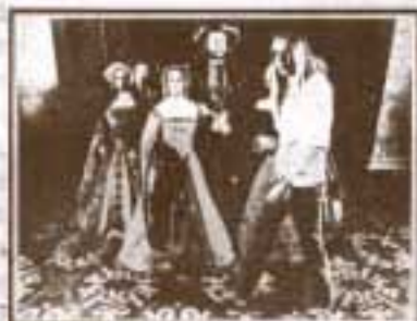
Rick Wakeman: The Six Wives of Henry VIII